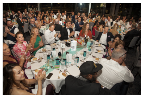
2018 Adventure Tourism Awards Gold Sponsor

Email: events@adventurequeensland.com.au