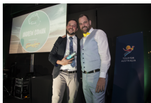
2019 Young Industry Legend Award Winner and Category Sponsor