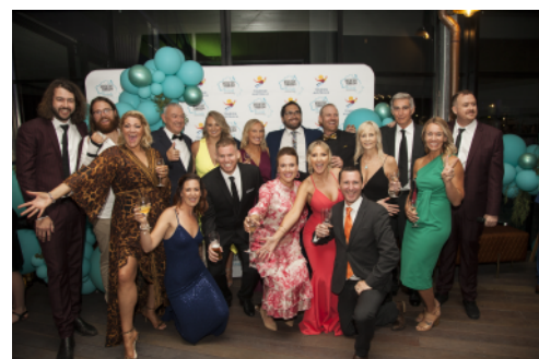
2019 AQ Board and Adventure Tourism Awards Emcees