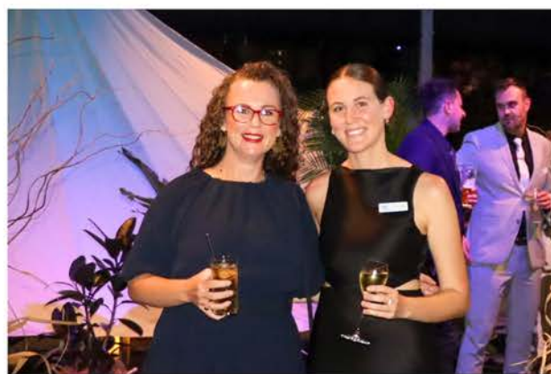
2023 Gold Sponsor and Keynote speakers

The Adventure Tourism Awards will provide a valuable environment for networking with key youth tourism industry leaders and decision makers and will showcase your services, supports and resources.