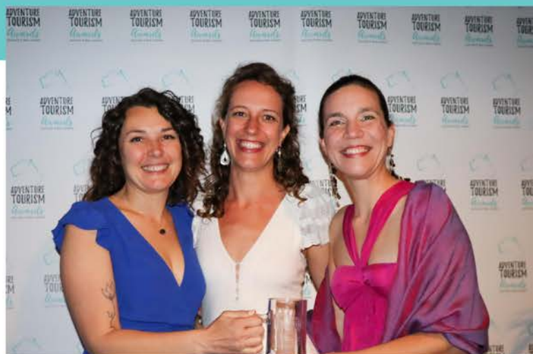
2023 Survivor Awards Winners

We have varying levels of tailored sponsorship packages available and an extensive promotional program to deliver maximum exposure for your brand. The sponsorship benefits associated with the Adventure Tourism Awards and Youth Travel Conference will spread across a wide range of mediums.