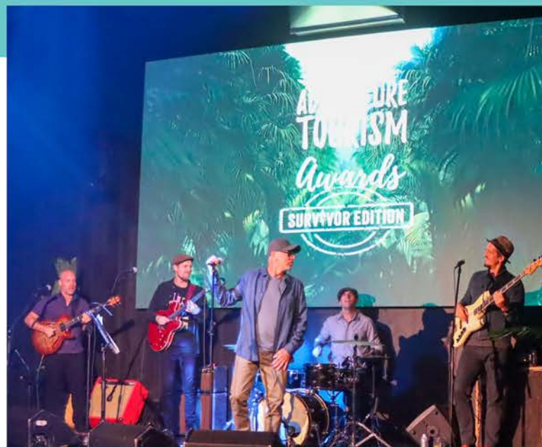
Worldclass Band - THUMP

Sponsorship spaces are limited and available on a first-come, best-fit basis. To apply to become a sponsor of the 2024 event, simply visit the website and complete the online sign-up form or email the AQ committee.