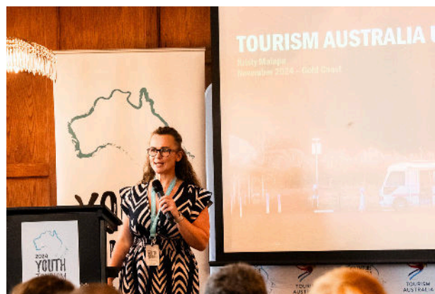
Tourism Australia 2024 Gold Sponsor and Keynote speakers

The Adventure Tourism Awards will provide a valuable environment for networking with key youth tourism industry leaders and decision makers and will showcase your services, supports and resources.