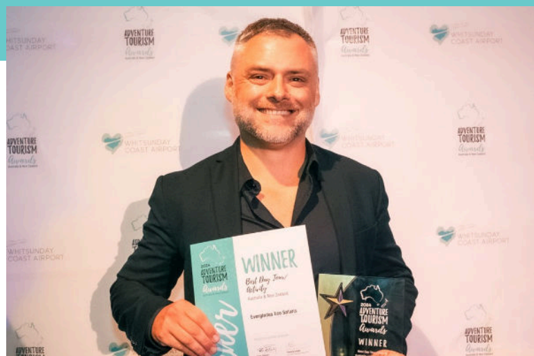
2024 Adventure Tourism Award Winner

We have varying levels of tailored sponsorship packages available and an extensive promotional program to deliver maximum exposure for your brand. The sponsorship benefits associated with the Adventure Tourism Awards and Youth Tourism Conference will spread across a wide range of mediums.